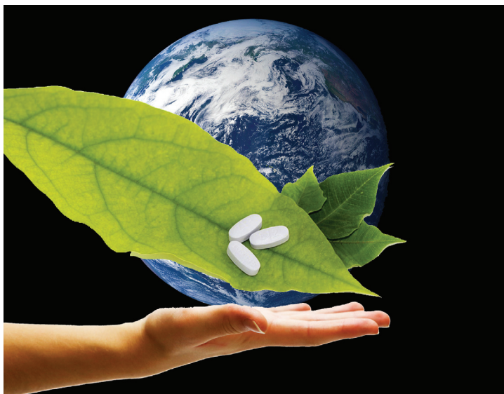
Photo: Illustration created by Milica Pešić using CC0 Creative Commons images (no attribution required).

Sound ethical oversight and responsible policy implementation needs to accompany exploration of medicinal species, whether bacteria, fungi, plants or